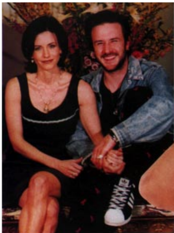
LEFT: Friends star Courteney with boyfriend David, the man "who makes me laugh"; and (right) the beautiful TV star.