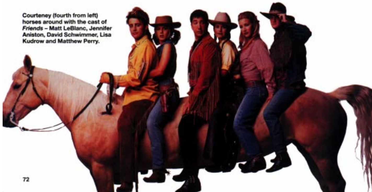
Courteney (fourth from left) horses around with the cast of Friends — Matt LeBlanc, Jennifer Aniston, David Schwimmer, Lisa Kudrow and Matthew Perry.

'I've always been shy, but with David it's different'