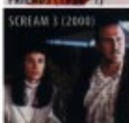
The girl-next-door who is so much more: After playing the girlfriend (and the most girlish friend), Cox Arquette has finally broken the babe mold. In the Scream trilogy, she's the femme fatale we love to hate